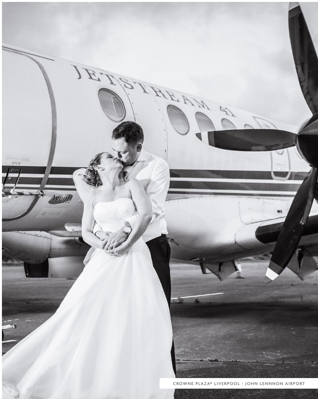
CROWNE PLAZA® LIVERPOOL - JOHN LENNON AIRPORT