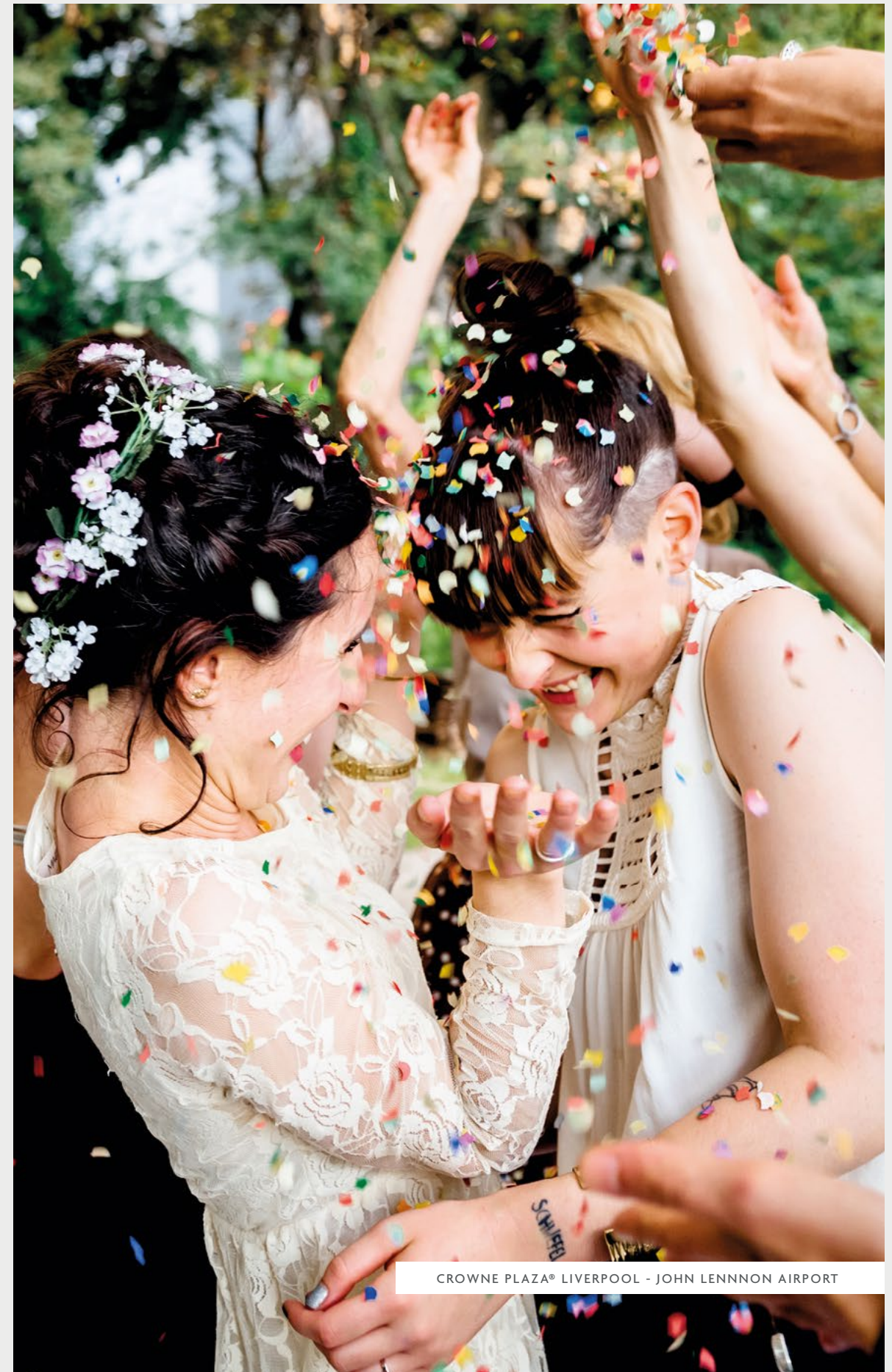
CROWNE PLAZA® LIVERPOOL - JOHN LENNON AIRPORT

St Georges Hall, St Georges Place, Liverpool, L1 1JJ PHONE: 0151 233 3004